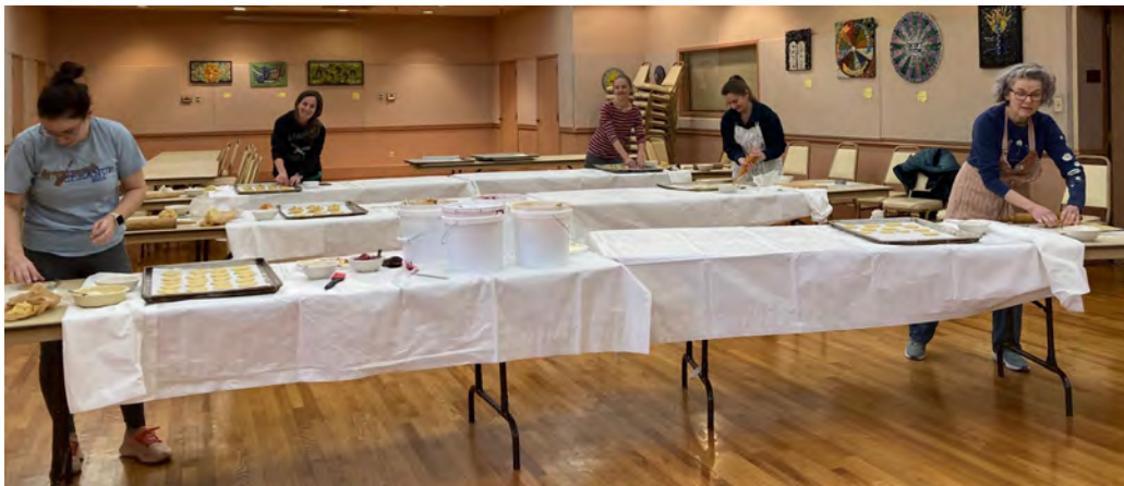
PURIM BAKING 2023

Congregants will soon receive information on joining Sisterhood, ways to participate in our activities and an invitation to join our leadership team. Remember, without you, we are one woman short.