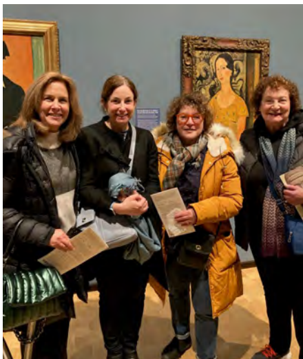
Taking in Modigliani at Barnes Museum exhibition